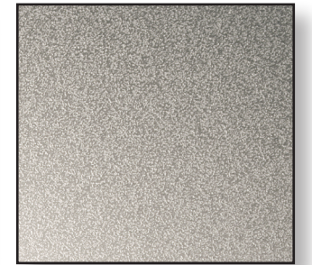
TextureMatte™ (Stainless Steel)