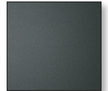
United Zinc: Onyx Black