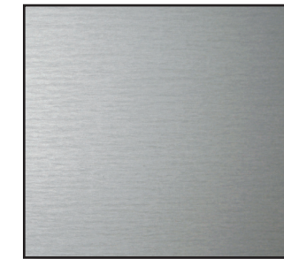
United Zinc: Glacier Gray